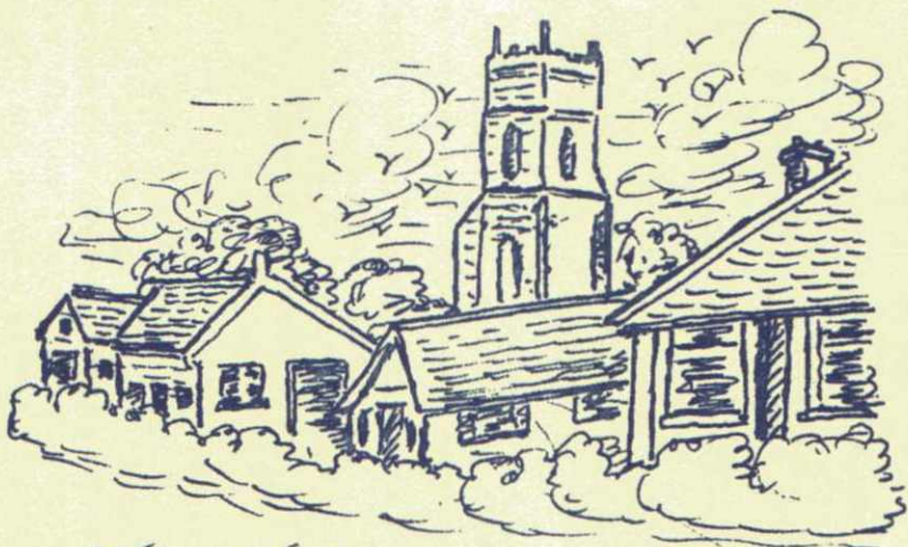
St. Thomas' Foxley