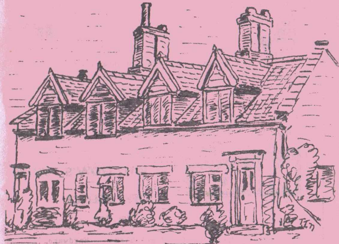
The Drift, Dereham Road, Bawdeswell. . . Tim Townshend