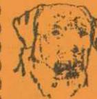
"JUSTICE LAW" ROTTWEILERS