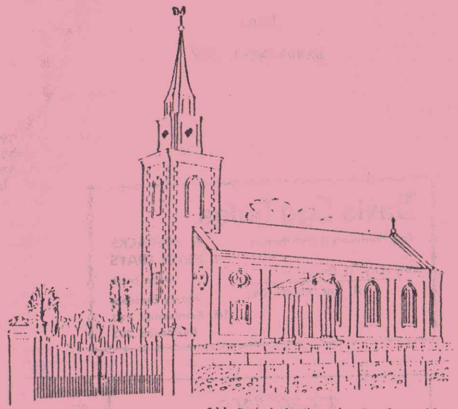
All Saints' Church, Bawdeswell

Bawdeswell Gardens Open Day 11th JUNE '89