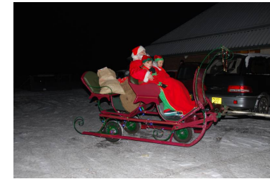
Santa & his Elves setting off around the village.

The carol singing around the village on 19 th December was highly successful, despite the arctic conditions. Because of the icy roads you will have noticed that Santa's sleigh was pulled by a tractor as it was considered to dangerous to use the horse.