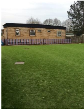
Our New Playground