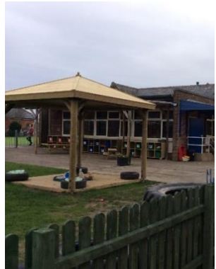
Our New Play Area.