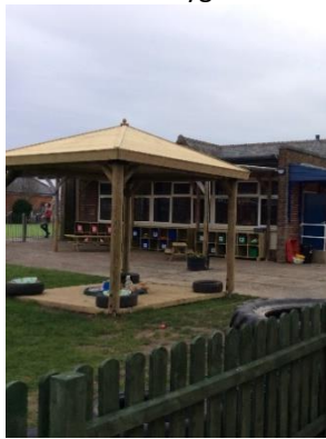
Our New Play Area.