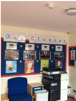
Our Reception Area.