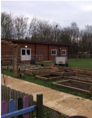
Our New Allotment.