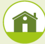
INTERIOR HOME IMPROVEMENTS